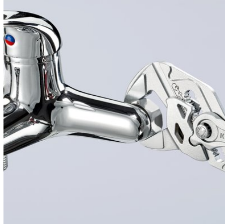
Working on plated fittings without damage of the surface